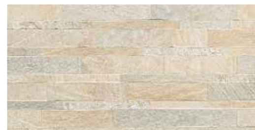
PO3060FRA2100 Fragas quartzo 17 30x60 - 12"x24"