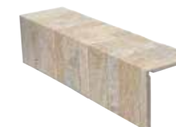
PO0830FRA21AN Fragas quartzo coprispigolo 43 8x8x30/3"x3"x12"