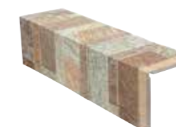
PO0830FRA22AN Fragas arenita coprispigolo 43 8x8x30/3"x3"x12"