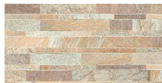
PO3060FRA2200 Fragas arenita 17 30x60 - 12"x24"