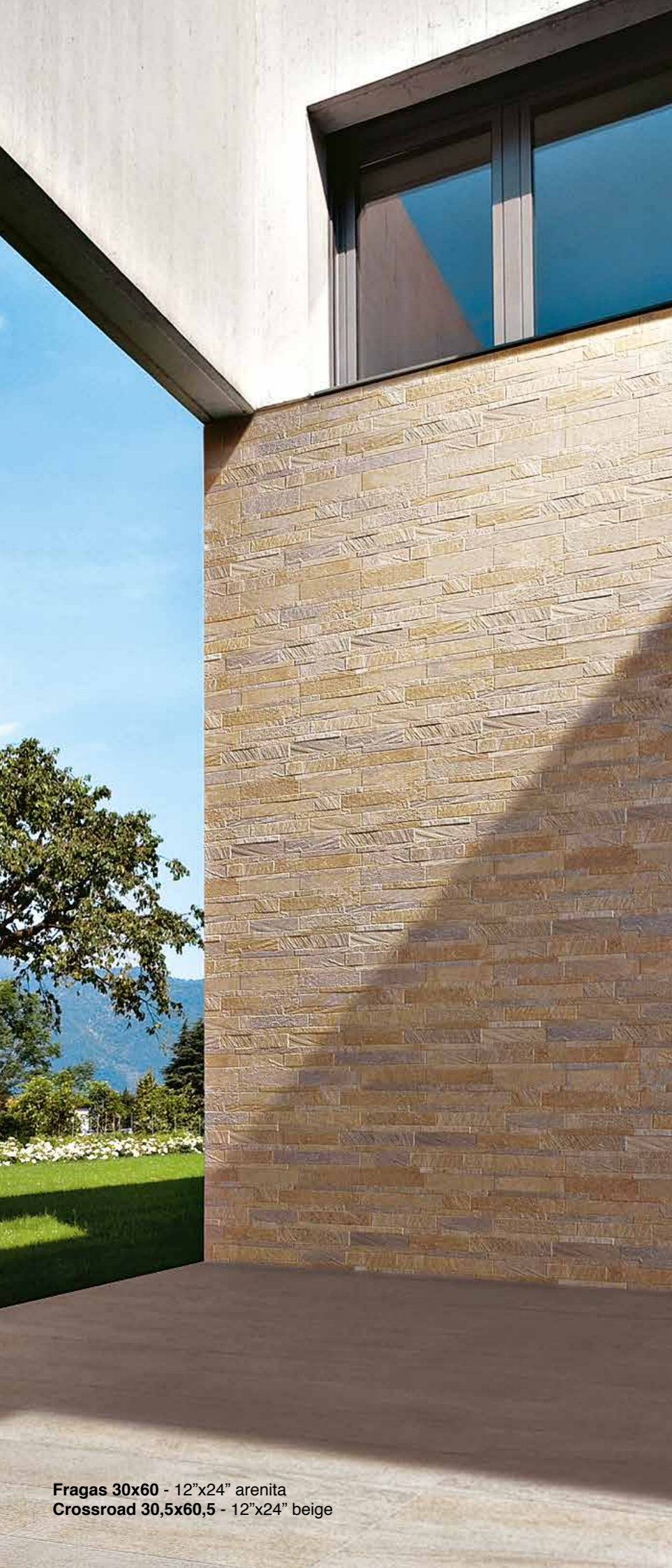
Fragas 30x60 - 12"x24" arenita Crossroad 30,5x60,5 - 12"x24" beige