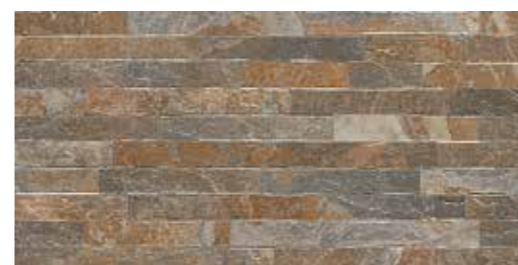
PO3060FRA2800 Fragas xisto 17 30x60 - 12"x24"